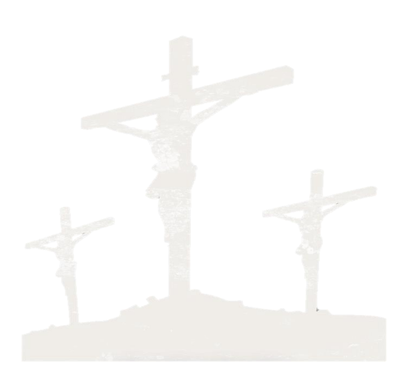
HYMN "Go to Dark Gethsemane" ELW 347 vs. 1 Silence for Reflection

<sup>39</sup> One of the criminals who hung there hurled insults at him: "Aren't you the Messiah? Save yourself and us!"<sup>40</sup> But the other criminal rebuked him. "Don't you fear God," he said, "since you are under the same sentence? <sup>41</sup> We are punished justly, for we are getting what our deeds deserve. But this man has done nothing wrong."<sup>42</sup> Then he said, "Jesus, remember me when you come into your kingdom. [d]"<sup>43</sup> Jesus answered him, "Truly I tell you, today you will be with me in paradise."